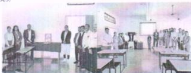
The Workshop started with performing Saraswati Pooja.

APIMR had organized a workshop on 17 th May 2023 to promote awareness among students about diverse issues concerning Resource Conservation & Lifestyle for Environment. After going through a series of pre-discussions & deliberations on the theme, APIMR students prepared their presentations on four key areas viz., Alternatives to plastic, E-Vehicles for Healthy Environment, Eco-Friendly Farming, and Importance of Preserving Forests. Following are few glimpses: