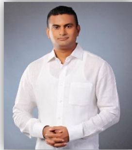
Hon'ble Shri Akshay Adhalrao Patil Secretary – SBSPM